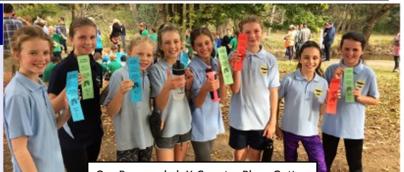
Our Porepunkah X-Country Place Getters